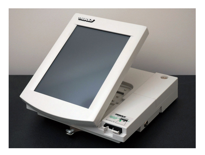
Figure 1: The Diebold AccuVote-TS voting machine

This paper reports on our study of an AccuVote-TS, which we obtained from a private party. We analyzed the machine's hardware and software, performed experiments on it, and considered whether real election practices would leave it suitably secure. We found that the machine is vulnerable to a number of extremely serious attacks that undermine the accuracy and credibility of the vote counts it produces.