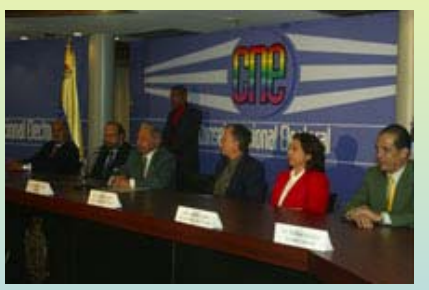
In the CNE decisions against the norms are taken with the vote of the 3 member who support Chavez unconditionally