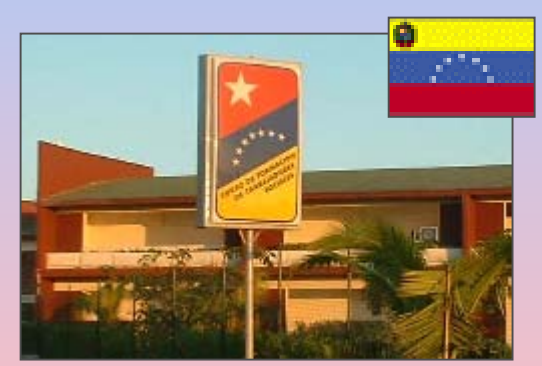
Center of ideological formation for Venezuelans in Cuba (compare with the actual Venezuelan flag)