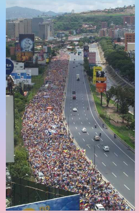
Millions have walked in tens of peaceful demonstrations, but the government always says they are a "small minority"