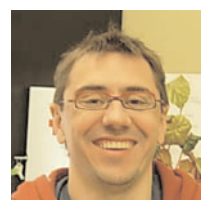
Juan Carlos Monedero