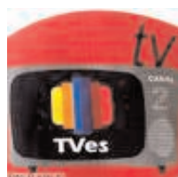
Televisora Venezolana social

RCTV is no more. It had to surrender its broadcast channel to a new public TV station, Televisora